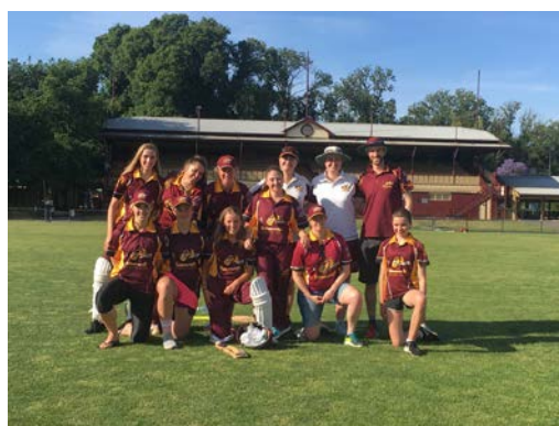
First Burra Women to play on BSO Turf!

During my time at Edinburgh, this has by far been the best year for the club. We played so well and had a great time doing it. I hope everyone continues to next season and I hope to see even more Juniors step up and continue to enjoy their cricket and the great club that is Edinburgh!