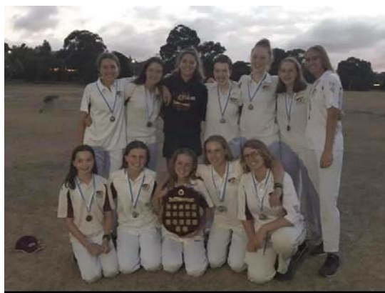
Champion Junior Girls won again, with finals cut short due to COVID (picture from a previous year)